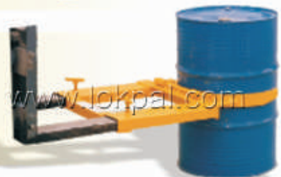
Adjustable Drum Grab For grabbing, lifting & shifting drums of variable dia