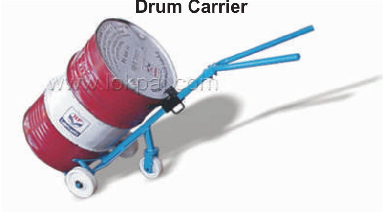
Tilting Drum Cradles