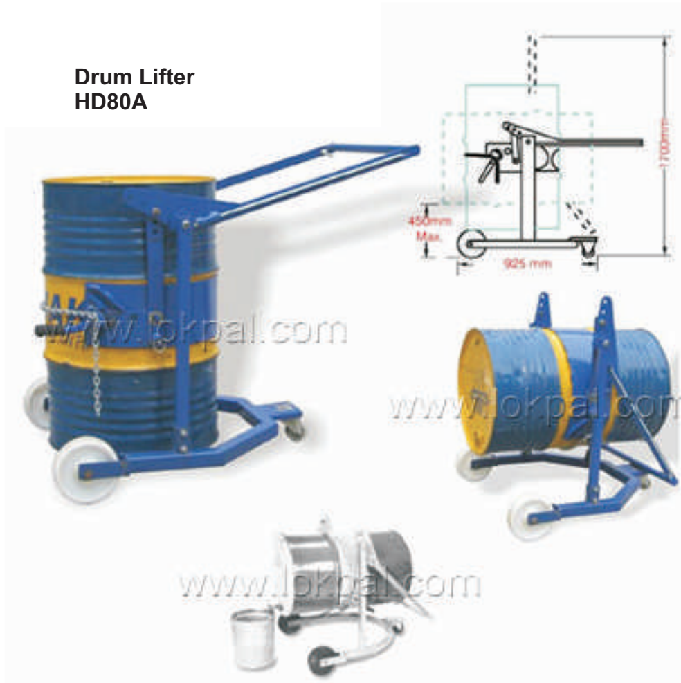
Drum Lifter HD80A